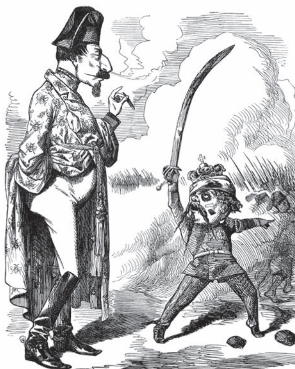
THE GIANT AND THE DWARF.

A cartoon published in Britain in June 1859. Napoleon III, on the left, is saying to King Victor Emmanuel, 'Bravo, my little fellow! You shall do all the fighting and we'll divide the glory.'