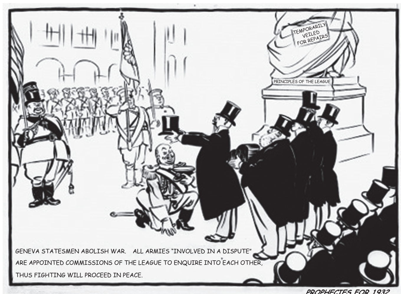
A British cartoon published in December 1931.